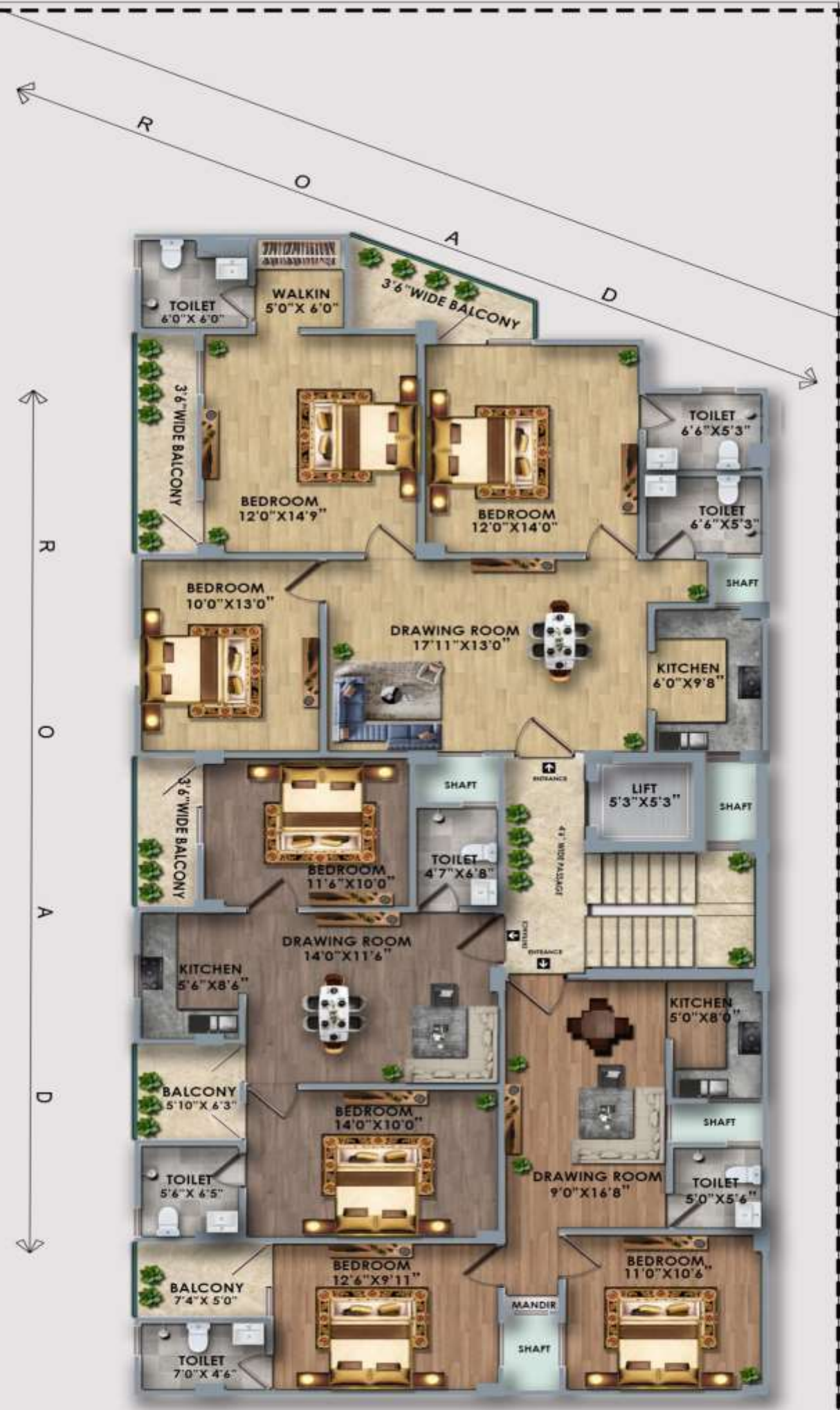
PROPOSAL LAYOUT PLAN @Typical Floor