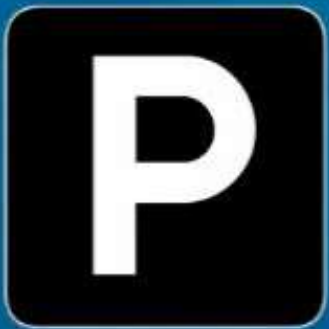
COMMON CAR PARKING